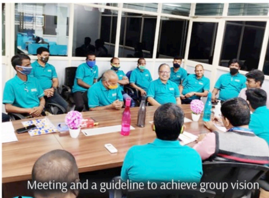
Meeting and a guideline to achieve group vision