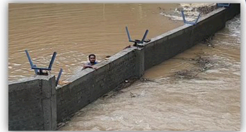
Heavy Rainfall triggers water logging