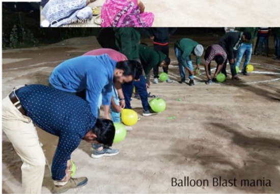
Balloon Blast mania