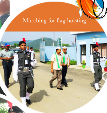
Marching for flag hoisting