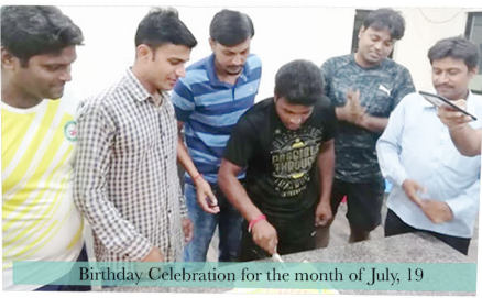
Birthday Celebration for the month of July, 19