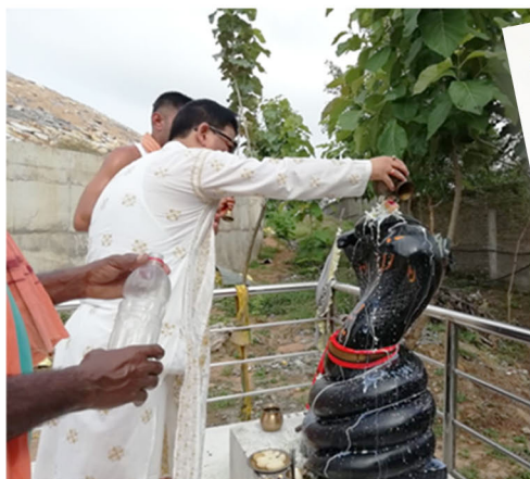
Naag panchami pooja at Naag mandir on 5th Aug, 2019