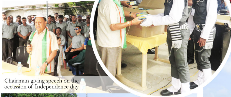
Chairman giving speech on the occasion of Independence day