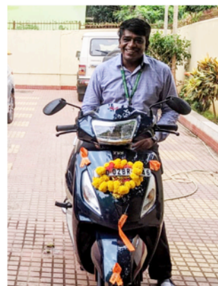
May 4, 2021: In order to make the commuting more convenient for office staffs, 2 TVS scooters were added.